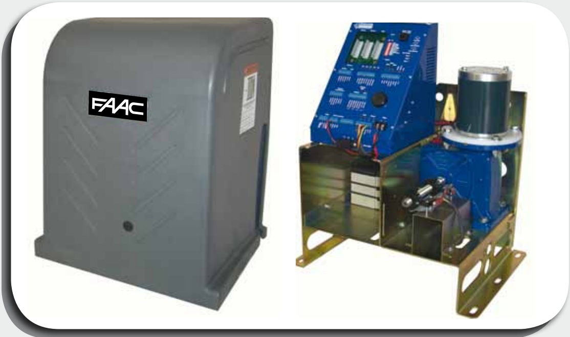
Wireless Master Slave Option